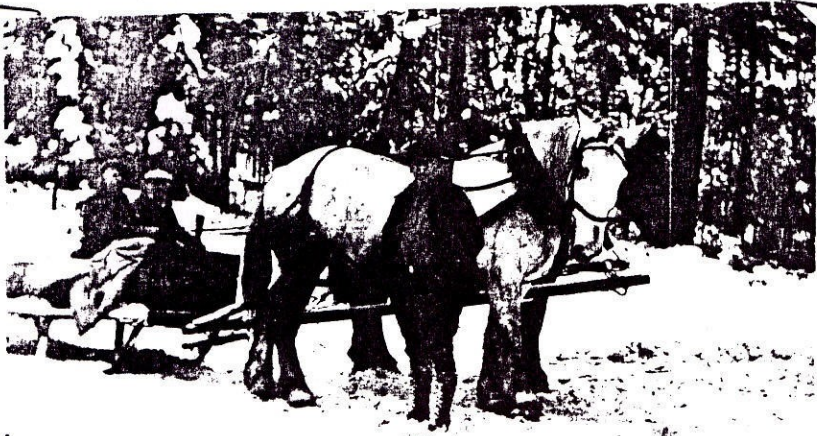
Clyde Estabrook & Tote team Rhineclondet wis 1940